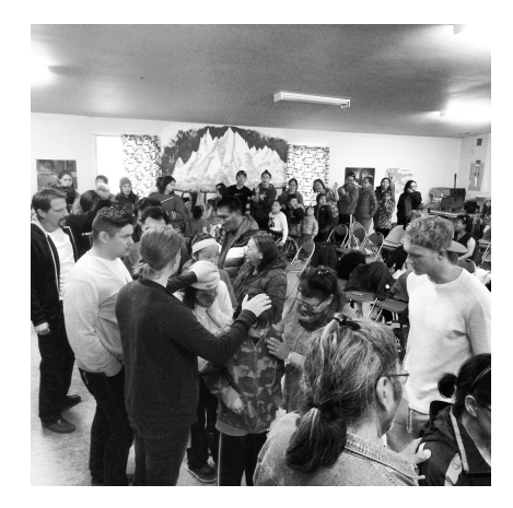
Ministry to youth in Cape Dorset, NU

Some highlights of the week included a young man's testimony of healing of severe ear pain, a young woman who found freedom and transformation as the Holy Spirit prompted her to forgive her father, and others who learned how to cut off the power of the enemy, who has plagued their hearts and minds. What a time of healing, spiritually, emotionally and physically!