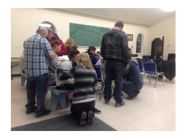
Ministering to young people in Cross Lake, MB

That's just about how I feel as I 'taste' what God is doing in lives throughout the nation this summer. As I have done for many years, this June I began declaring, "This is a Summer of Miracles!" I stated it with the same expectation as I've had every summer, but when I see the outstanding miracles already happening so far, it 'blows my mind'!