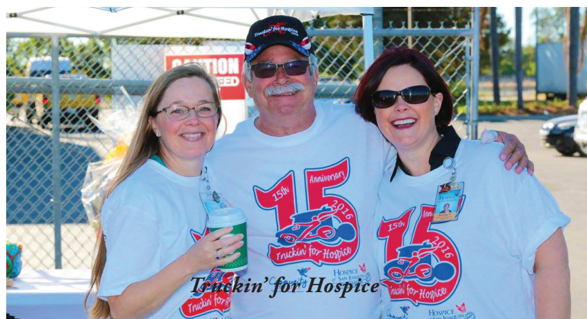
Truckin' for Hospice