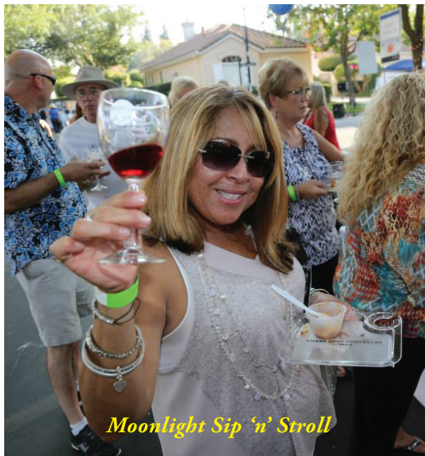
Moonlight Sip 'n' Stroll