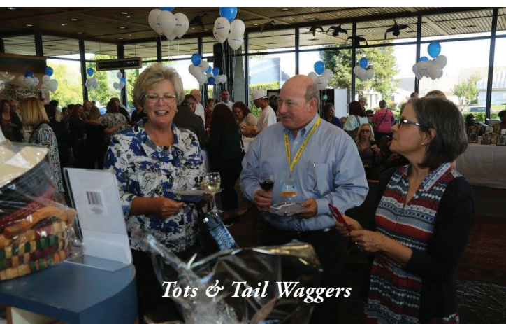
Tots & Tail Waggers