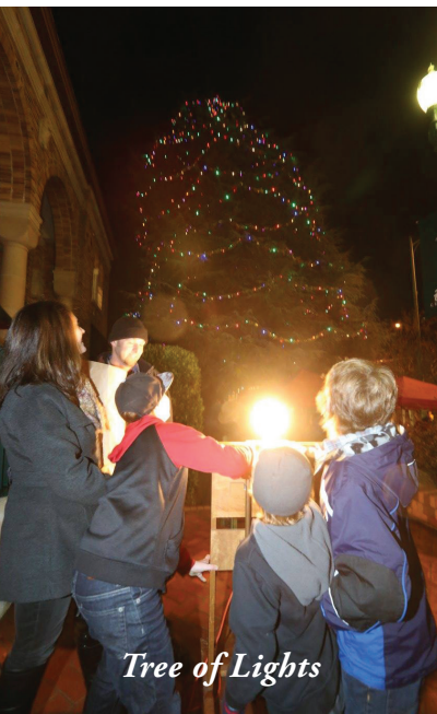
Tree of Lights