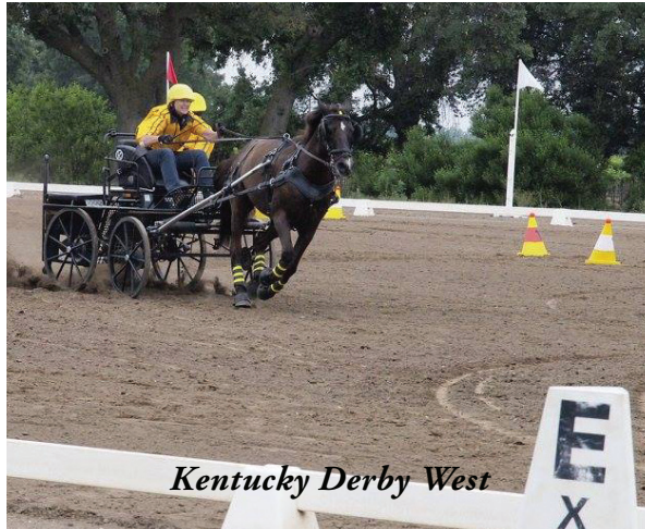
Kentucky Derby West