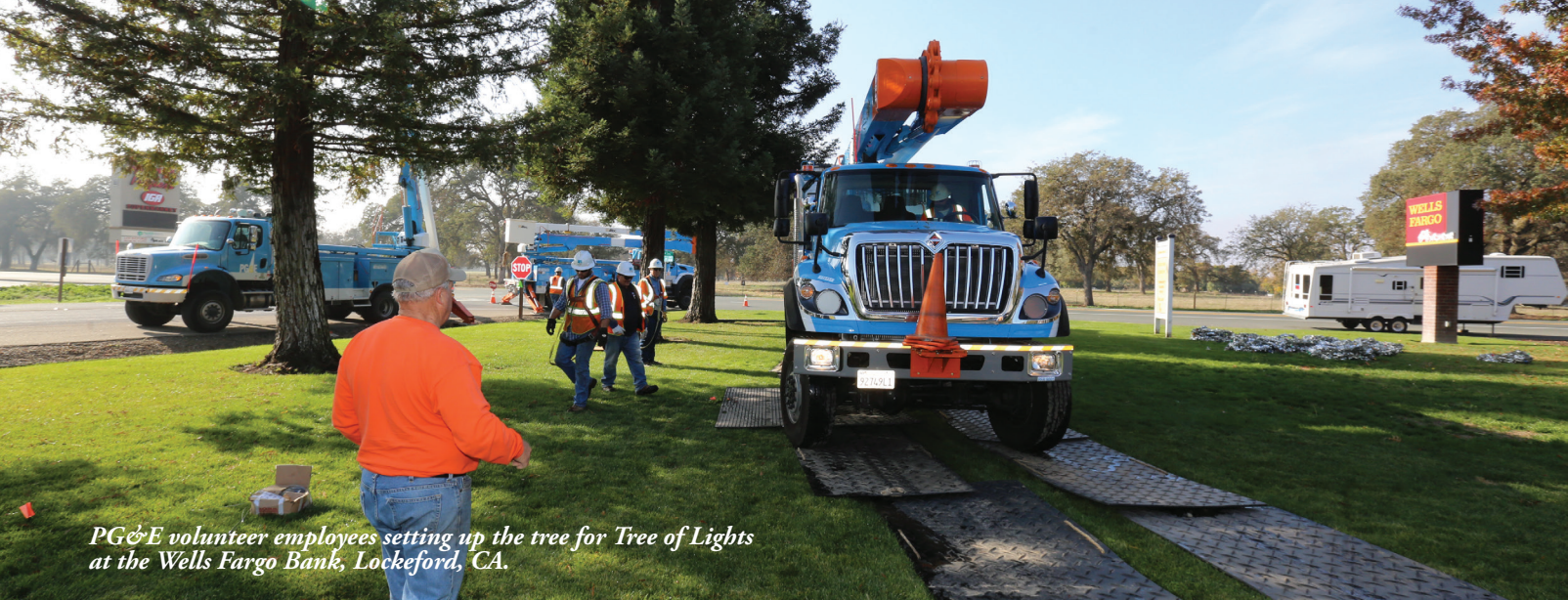
PG&E volunteer employees setting up the tree for Tree of Lights at the Wells Fargo Bank, Lockeford, CA.