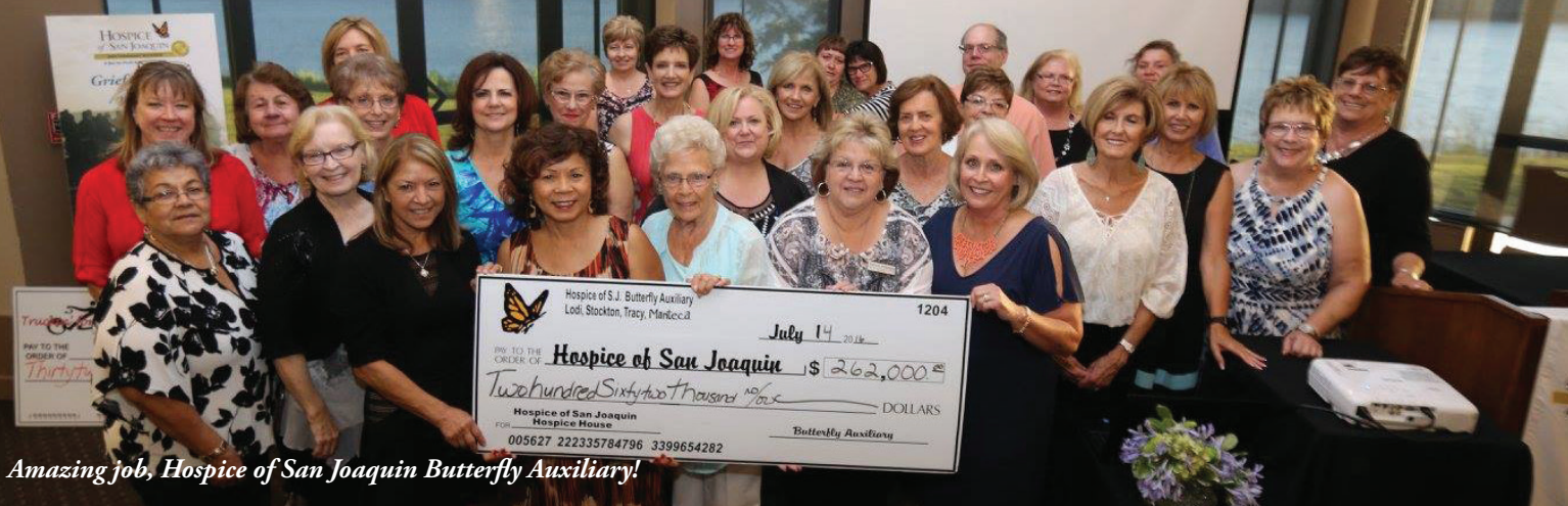
Amazing job, Hospice of San Joaquin Butterfly Auxiliary!