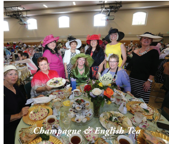
Champagne & English Tea